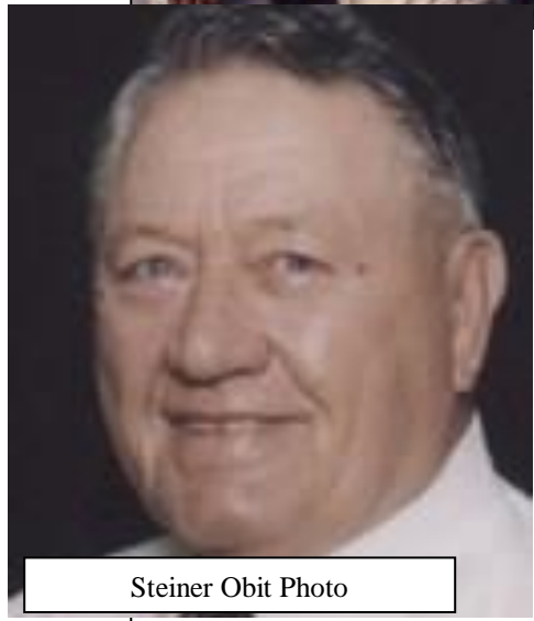
Steiner Obit Photo