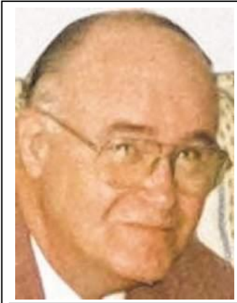
Eggers Obit Photo